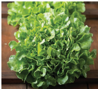
Lettuce, Oakleaf - Bauer: Dark green, oakleaf head lettuce