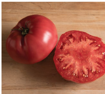
Slicing Tomato, Pruden's Purple: Purple-brown; indeterminate; hybrid