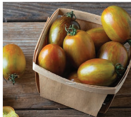
Cherry Tomato, Magic Bullet: Multicolored green, yellow, and pink with streaks of indigo; indeterminate; heirloom