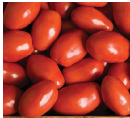
Paste Tomato, Paisano: Red; determinate; hybrid