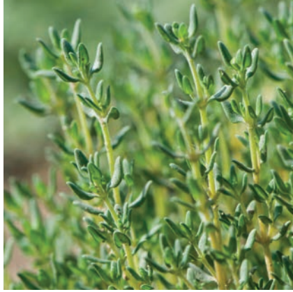
Thyme: Culinary herb and pollinator favorite; great addition to hearty grains and potatoes