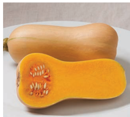
Butternut, Butterscotch: Small butternut; no curing needed; store up to 3 months; short vining plant (6' spacing)