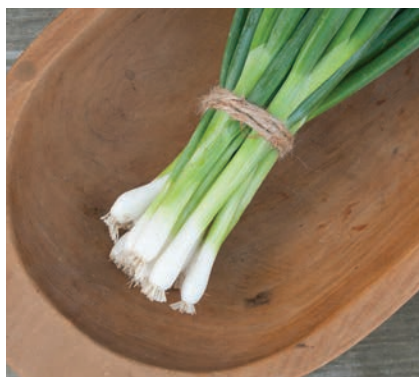
Green Onion, Evergreen Hardy White: Great with eggs or as an addition to Mexican and Asian dishes