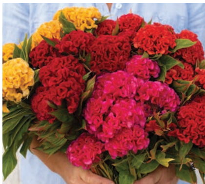
Celosia, Chief Mix: Crested cockscomb; colors include gold, rose, persimmon, and red shades; each pack will vary!