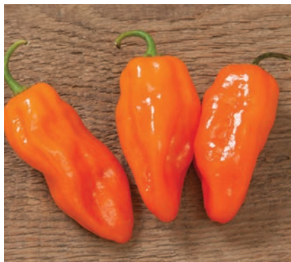
Habañero, Helios: Extremely hot! Orange, habenero peppers