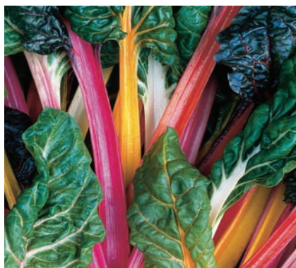
Swiss Chard, Bright Lights: Multi-color Swiss chard; plants may have stems that are white, yellow, orange, red, or pink.