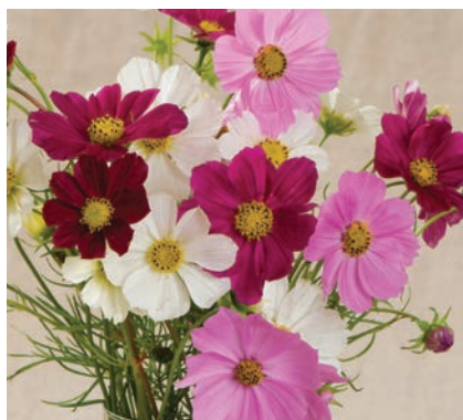
Cosmos, Versailles Mix: Colors in blush pink, white, carmine red, and pink; each pack will vary!