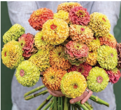
Zinnia, Queeny Formula Mix: Blooms in shades of rose, orange, peach, lemon, and lime; each pack will vary!