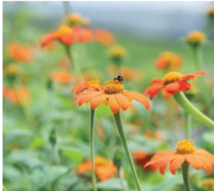
Tithonia (Mexican Sunflower): Tall, vigorous, branching plant; nectar is great for bees, butterflies, and hummingbirds, seeds will attract birds