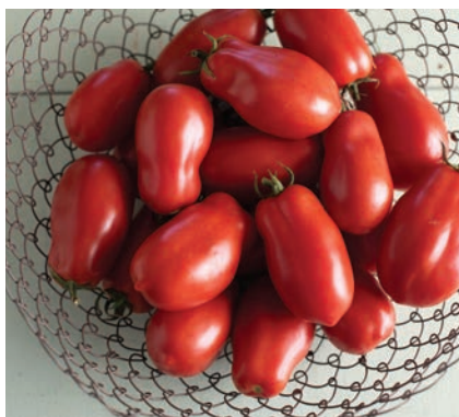
Paste Tomato, San Marzano II: Classic Italian-style paste tomato