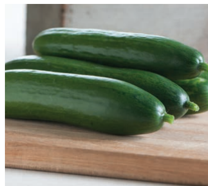
Cucumber, Diva: Thin-skinned, seedless cucumber with a crisp, sweet taste; 5–7" fruits