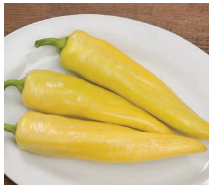
Banana Pepper, Goddess: Sweet banana pepper for pickling or eating fresh; thick-walled