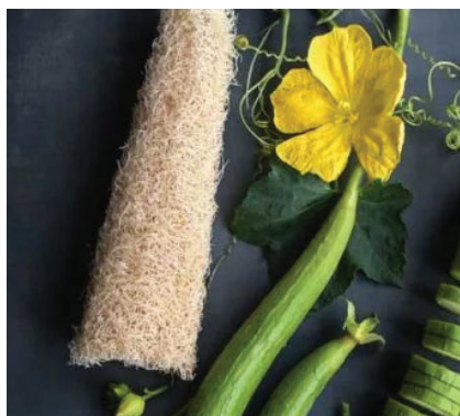
Luffa: Gourd plant that can be grown for its edible young fruit or matured and dried for a natural "dishcloth"