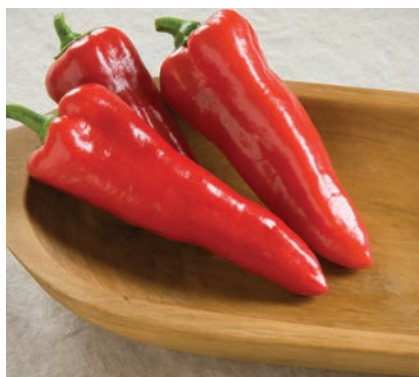
Sweet Pepper, Carmen: Red sweet pepper; bull's horn shape