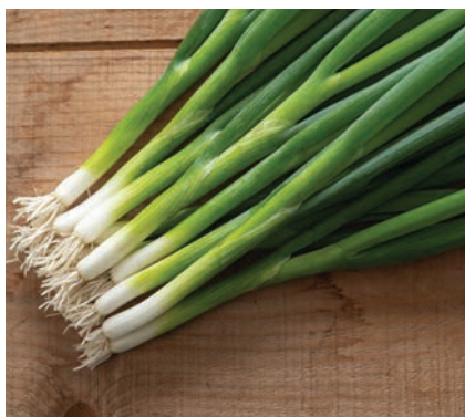
Green Onion, Feast: Great with eggs or as an addition to Mexican and Asian dishes