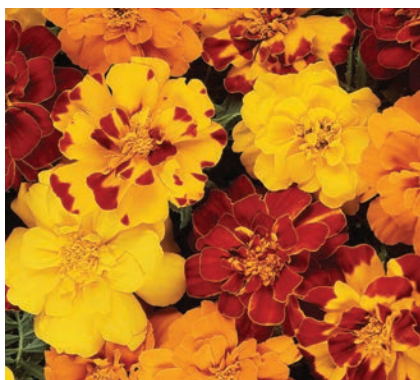
Marigold, Durango Outback Mix: Yellow, orange, deep-orange, and variegated mix; each pack will vary!