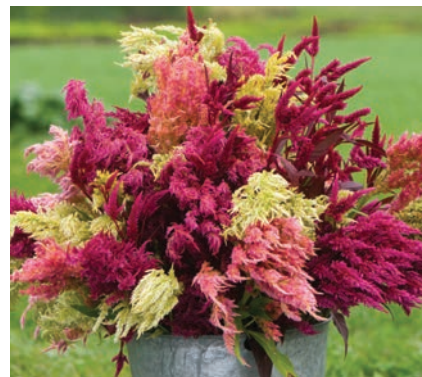
Celosia, Pampas Plume: Feathery plumes in scarlet, orange, bright yellow, pink, and cream; each pack will vary!