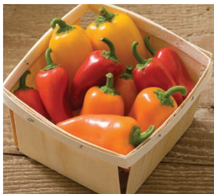
Sweet Pepper, Lunchbox: Red, orange, and yellow mini sweet peppers