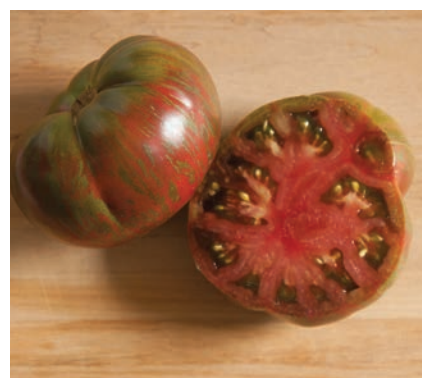
Slicing Tomato, Pink Berkley Tie Dye: Dusty pink with green and yellow stripes; indeterminate, heirloom