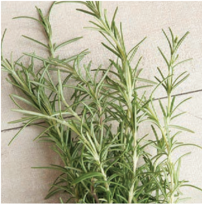
Rosemary: Culinary herb, use in mashed potatoes, focaccia, and marinades