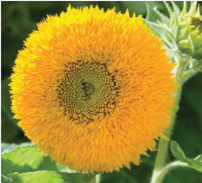
Sunflower, Teddy Bear (dwarf): Dwarf sunflower, for in-ground or container planting; branching, shaggy blooms with minimal pollen