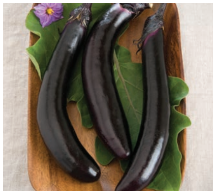
Eggplant, Orient Express: Asian eggplant with purple fruit and calyx