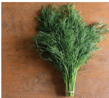
Thalia Dill: Slow bolting with uniform habit