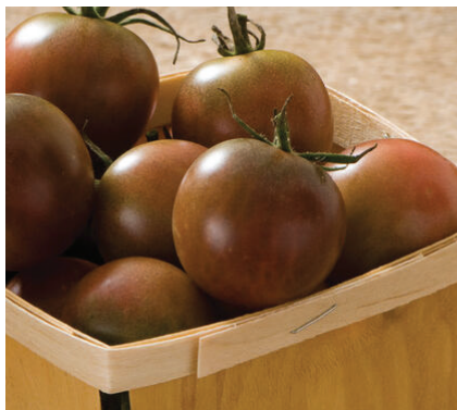
Cherry Tomato, Black Cherry: Purple-brown; indeterminate; heirloom