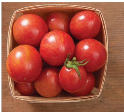
Cherry Tomato, Pink Bumblebee: Pink and yellow; indeterminate; heirloom