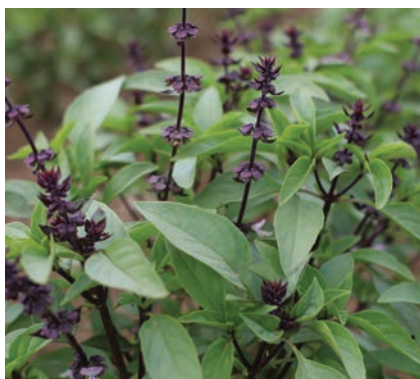
Sweet Thai Basil: Great for Asian cuisine—rice, noodle bowls, stir fry, etc.