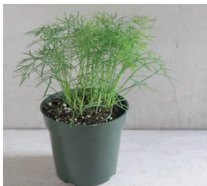
Fernleaf Dill: Dwarf dill; great for containers