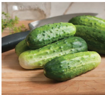
Cucumber, H-19 Little Leaf: Compact plant with seedless fruits, averaging 3–5"; great for eating fresh or pickling