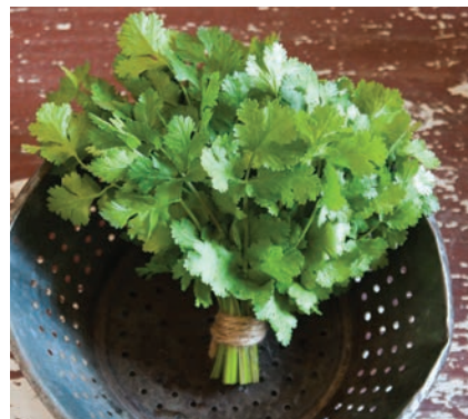
Cilantro, Cruiser: Slow bolting with uniform habit