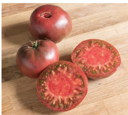
Slicing Tomato, Cherokee Purple: Purple-brown; indeterminate; heirloom