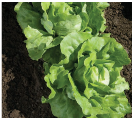
Lettuce, Butterhead - Nancy: Green, butterhead lettuce