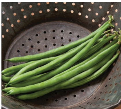
Bush Beans, Jade: 6–7", slender, deep green pods