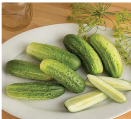
Cucumber, Cool Customer: Pickler; stress tolerant producer; 4–5" fruits