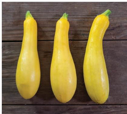
Butterfingers: Spineless yellow summer squash