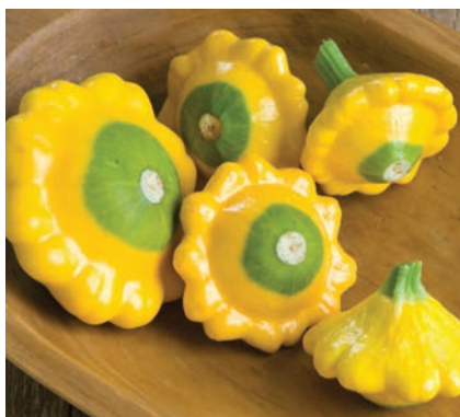
Patty Pan, Y-Star: Yellow fruits with scalloped shape; light green on blossom end