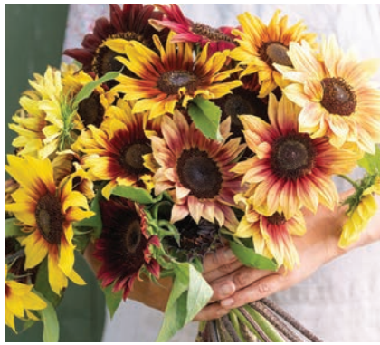
Sunflower, Daydream Mixture: Variegated yellows and mahoganies; minimal pollen; branching