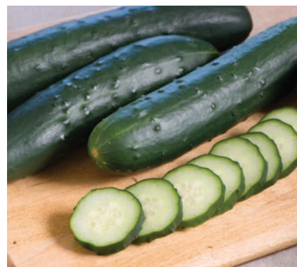
Cucumber, Corinto: Seedless slicing cucumber; fruits average 7–8"