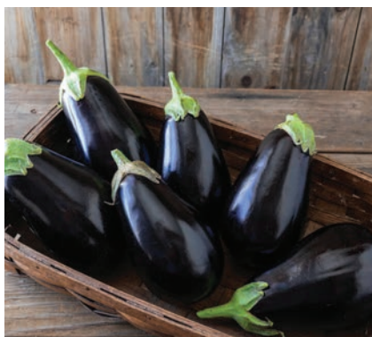
Eggplant, Thanos: Spineless, black-bell type