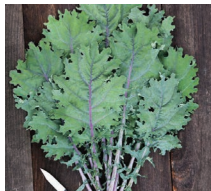
Red Russian Kale: Leaves are tender and flatter than curly kale with a signature red stem. Very mild flavor