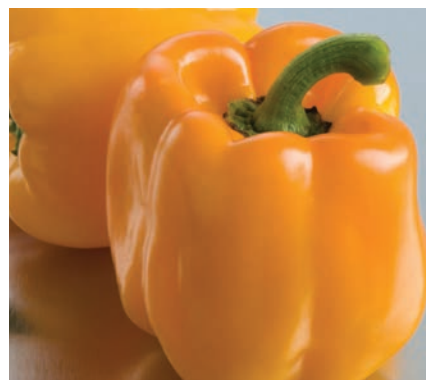
Sweet Pepper, Sweet Sunrise: Yellow sweet bell