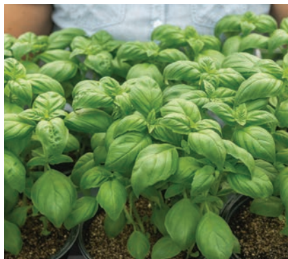
Lih Prospera Basil: Italian basil—perfect for pesto and to add freshness to any Italian dish