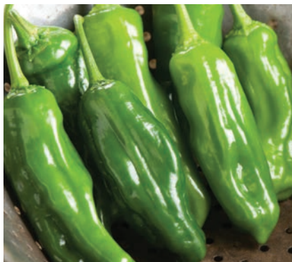
Shishito Pepper, Mellow Star: Mild shishito pepper; thin-walled; delicious fresh or cooked