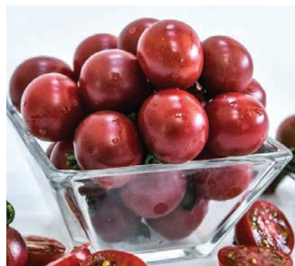
Cherry Tomato, Rosella: Purple-red; indeterminate