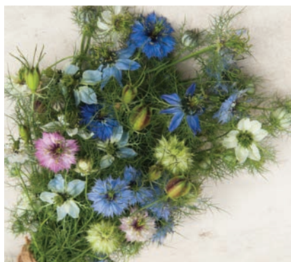
Nigella, Love-In-A-Mist: Blue, mauve, pink, purple, and white blooms; feathery foliage; unique seed pods; each pack will vary!