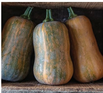
Honeynut: Mini butternut; distinctive, dark tan color; later-maturing