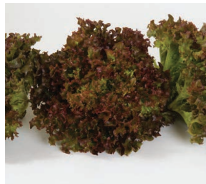
Lettuce, Red Incised Salanova: Head lettuce