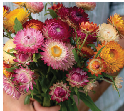
Strawflower, Choice Mix: Papery petals in gold, orange, peach, pink, purple, raspberry, and red