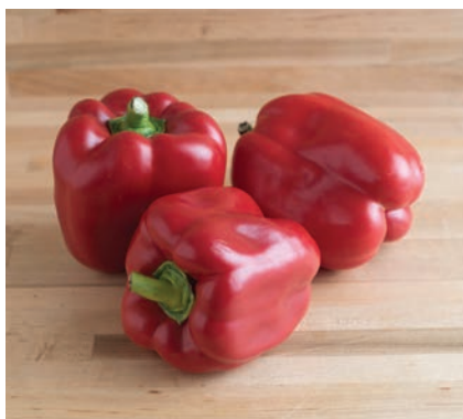
Sweet Pepper, Red Knight: Red sweet bell