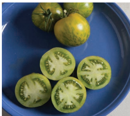
Salad Tomato, Green Zebra: Bicolor green and yellow; indeterminate; heirloom