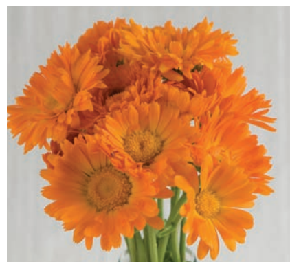
Calendula, Alpha: Bright orange blooms; dry for teas