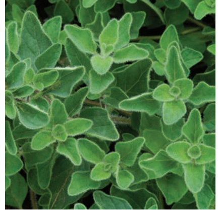
Oregano: Culinary herb, delicious in tomato sauce