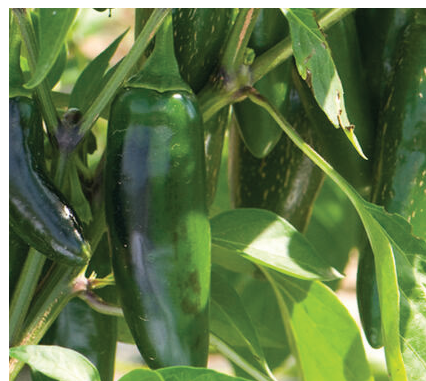
Jalapeño, Jalafuego: High-yielding jalapeño plant with green, spicy fruit; great in pico de gallo