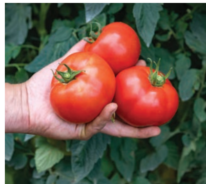
Slicing Tomato, Celebrity Plus: Red; determinate; hybrid; disease resistance