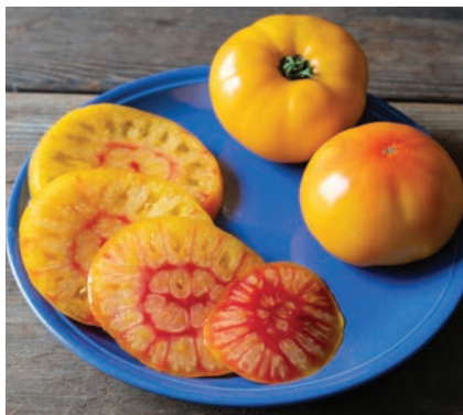
Slicing Tomato, Harvest Moon: Yellow and red; indeterminate; hybrid