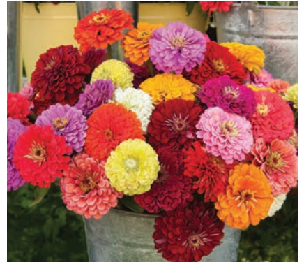
Zinnia, Benary's Giant Mix: Colors include deep red, orange, carmine rose, coral, lime, wine, purple, bright pink, white, salmon rose, scarlet, and golden yellow; each pack will vary!