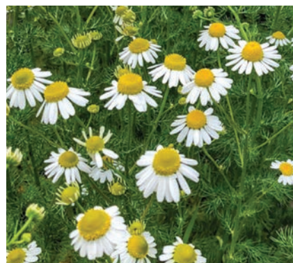
German Chamomile ( Matricaria recutita ): Easily grown in dry to medium moisture, well- drained soils in full sun. Tolerates light shade. Dry for teas.