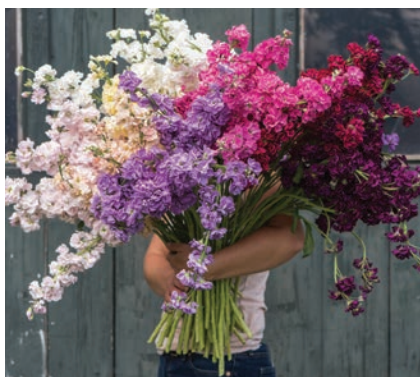
Stock, Katz Formula Mix: Luscious blooms in apricot, bright pink, wine red, pale purple, creamy yellow, dark purple, pale pink, and pure white; single-cut (no pinching!)