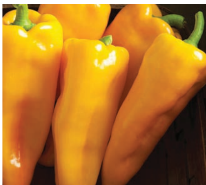
Sweet Pepper, Escamillo: Yellow sweet pepper; bull's horn shape