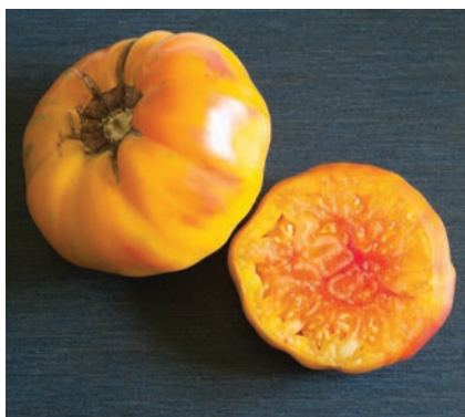
Slicing Tomato, Striped German: Bicolor yellow and red; indeterminate; heirloom