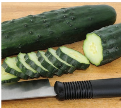
Cucumber, Marketmore 76: Slicing cucumber with fruits averaging 8–9"