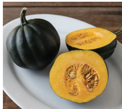
Honeybear: Small acorn squash; dark green skin with deep orange flesh; semi-bush