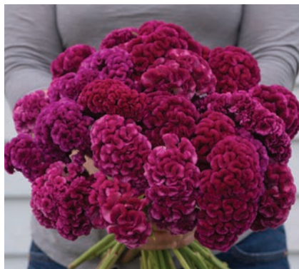
Celosia, Cramer's Rose: Rose-colored; crested cockscomb