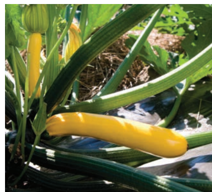
Golden Glory: Spineless yellow summer squash