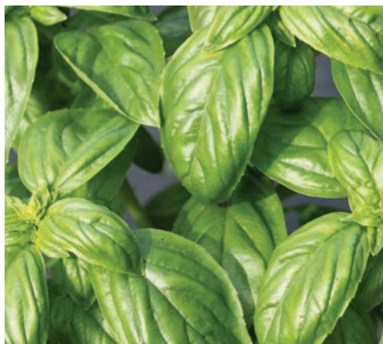
Superbo Basil: Italian basil—perfect for pesto and to add freshness to any Italian dish