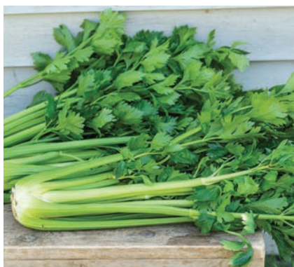
Celery: Water well for successful harvest!