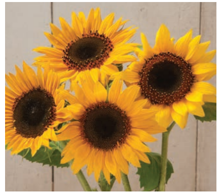
Sunflower, Holiday: Golden petals with dark brown center; bears pollen, good for bee forage; branching