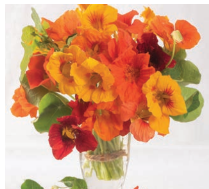
Nasturtium, Kaleidoscope Mix: Mix includes red, rose, yellow, orange, and cream colored flowers; each pack will vary!