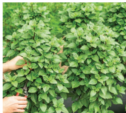
Everleaf Thai Towers Basil: Great for Asian cuisine—rice, noodle bowls, stir fry, etc.