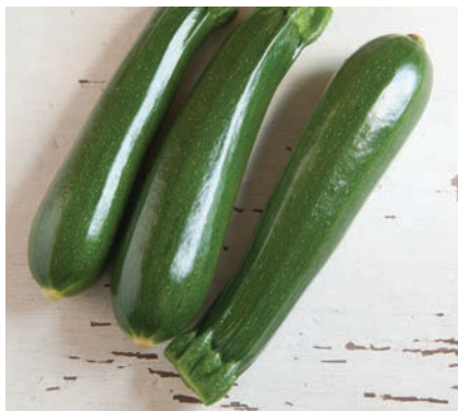
Zucchini, Dunja: Green summer squash with short spines