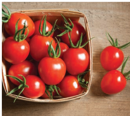
Cherry Tomato, Cherry Bomb: Red; indeterminate; hybrid