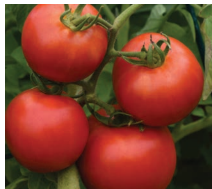
Slicing Tomato, Early Girl: Red; indeterminate; hybrid