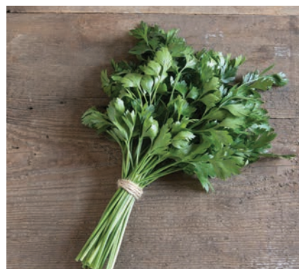
Giant of Italy Flat Leaf Parsley: flat-leaf style parsley, preferred for culinary use; strong, upright stems makes for easy harvest