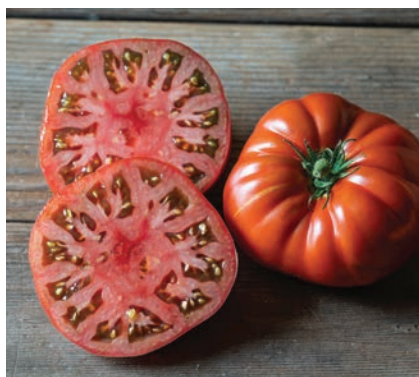
Slicing Tomato, Tasmanian Chocolate: Red-brown; determinate; heirloom; container-friendly