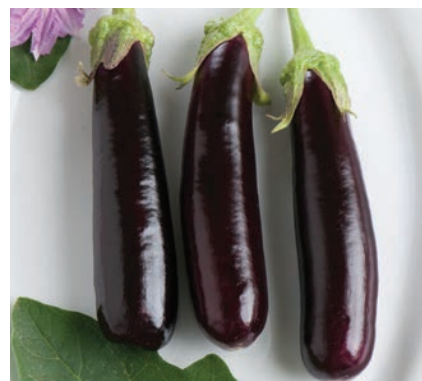
Eggplant, Hansel: Compact plant can be grown in containers; mini eggplants (3–4")