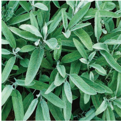
Sage: Full sun to part shade; classic favorite herb for poultry