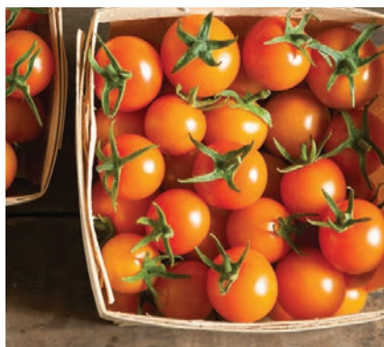
Cherry Tomato, Sun Gold: Yellow; indeterminate; hybrid