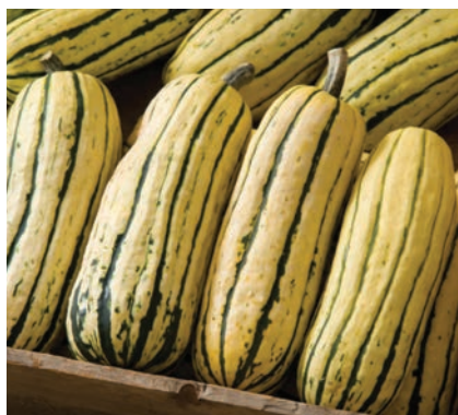
Delicata: Oblong shape; yellow and dark green stripes; tender skin can be left on